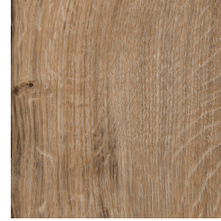
Featured Oak SG5W2533