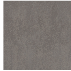
Metropolis Smoke SG5S2627