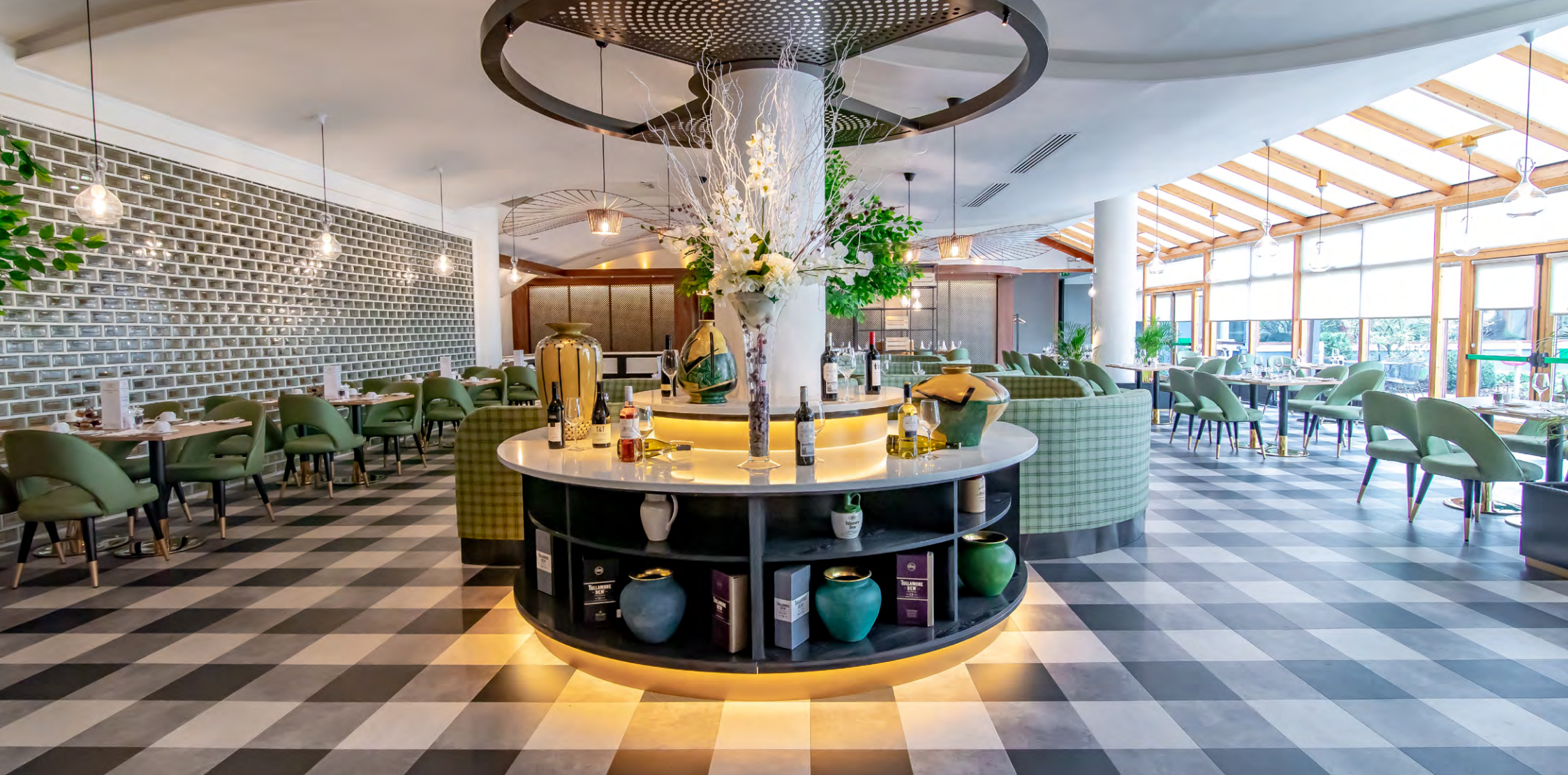
↗ Featured: Graphite Slate, Basilica Salt & Kura Caraway