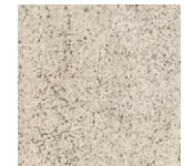
Basilica Salt AROSBS12