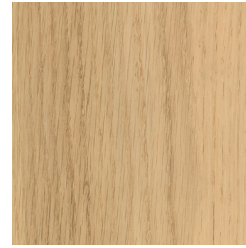
Blonde Oak AROW7460