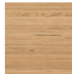
Fused Birch AR0W7500