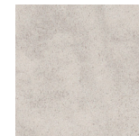
Ceramic Light SS5S1565