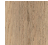
Cornish Oak AROW8150