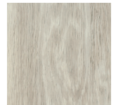
White Wash Wood AROW7680