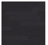
Back to Black Vamp AROABB22