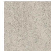
Basilica Salt AROSBS12