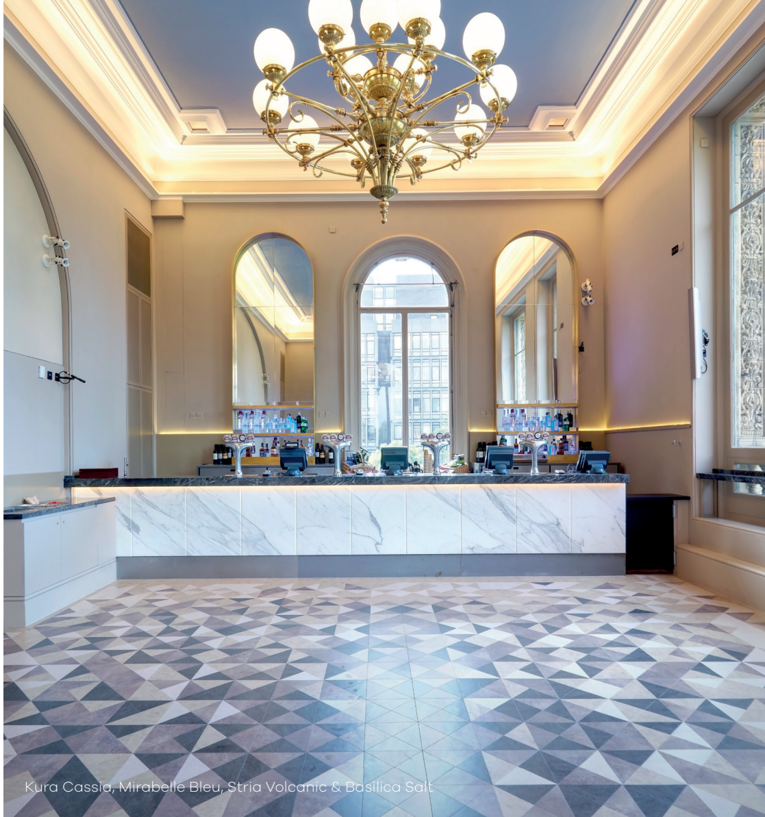
Kura Cassia, Mirabelle Bleu, Stria Volcanic & Basilica Salt