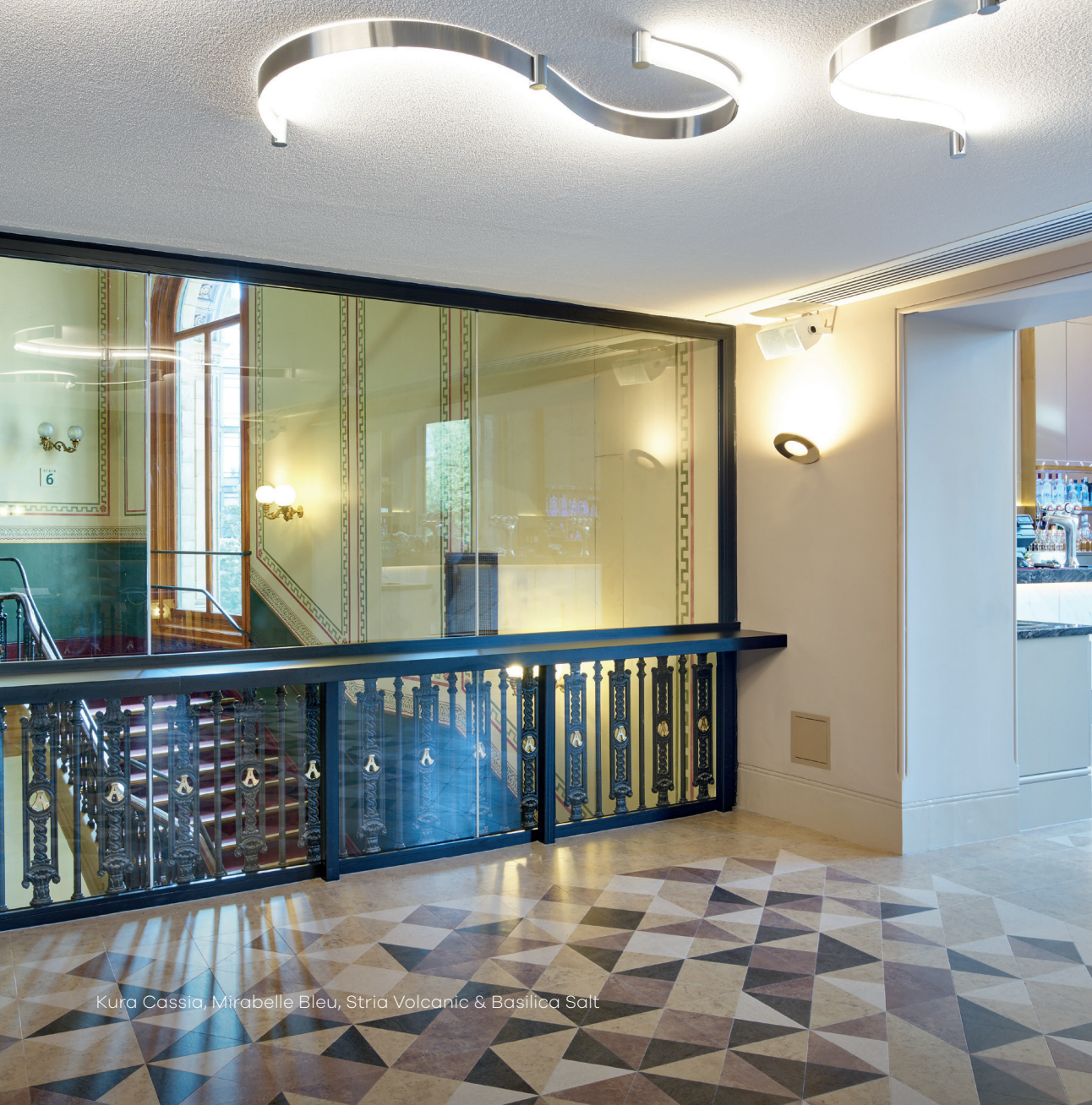
Kura Cassia, Mirabelle Bleu, Stria Volcanic & Basilica Salt