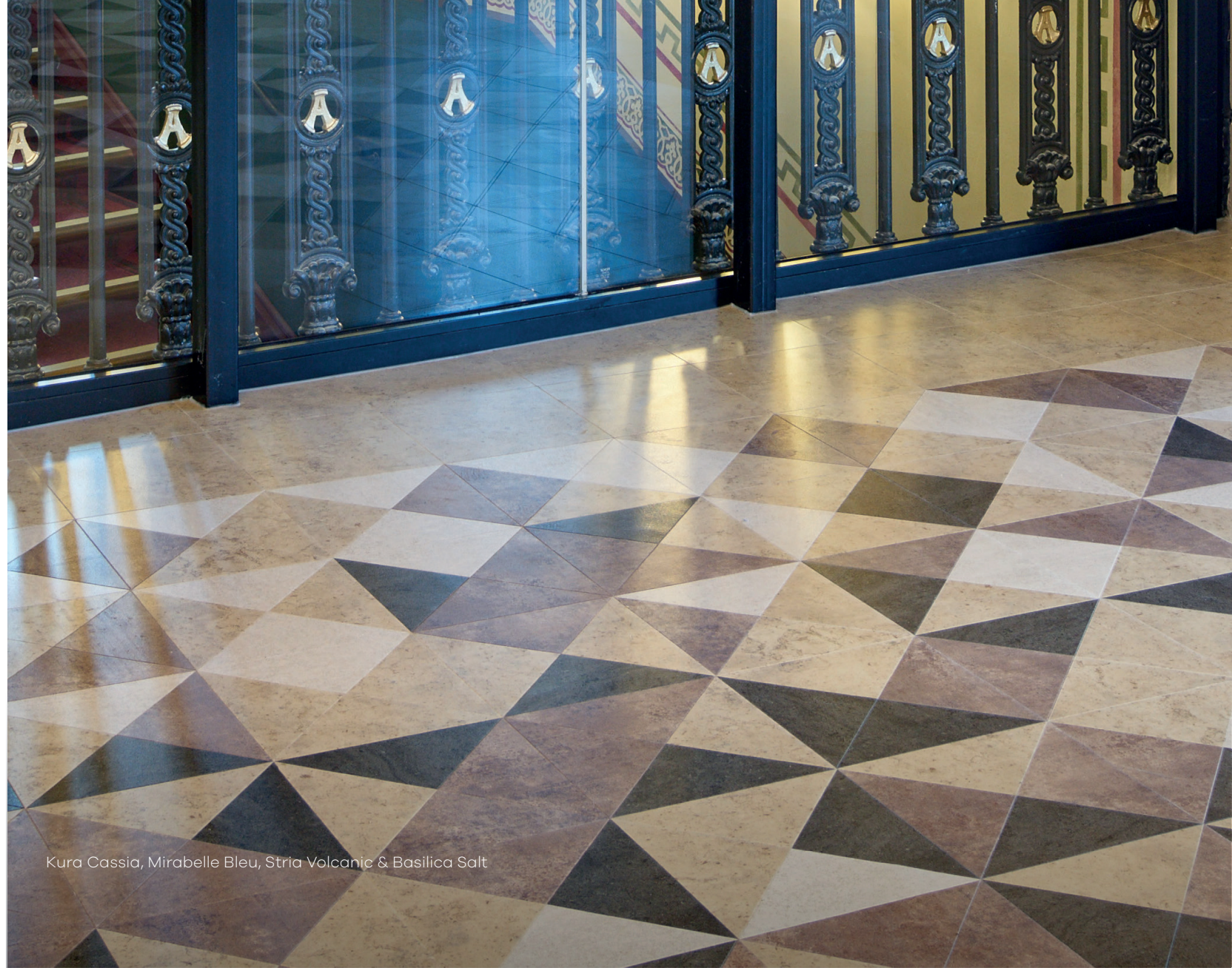
Kura Cassia, Mirabelle Bleu, Stria Volcanic & Basilica Salt

To fulfill the requirements, the in-house creative team at Amtico provided advice on product choice, laying patterns and finishes, while CAD experts worked with the project's designers to perfect the design ready for manufacture.