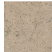
Mirabelle Bleu AROSMB34