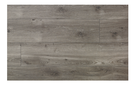
Laying Pattern Stripwood