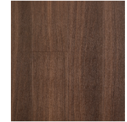
Exotic Walnut SS5W2541