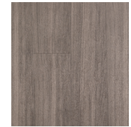
Dusky Walnut SF3W2542