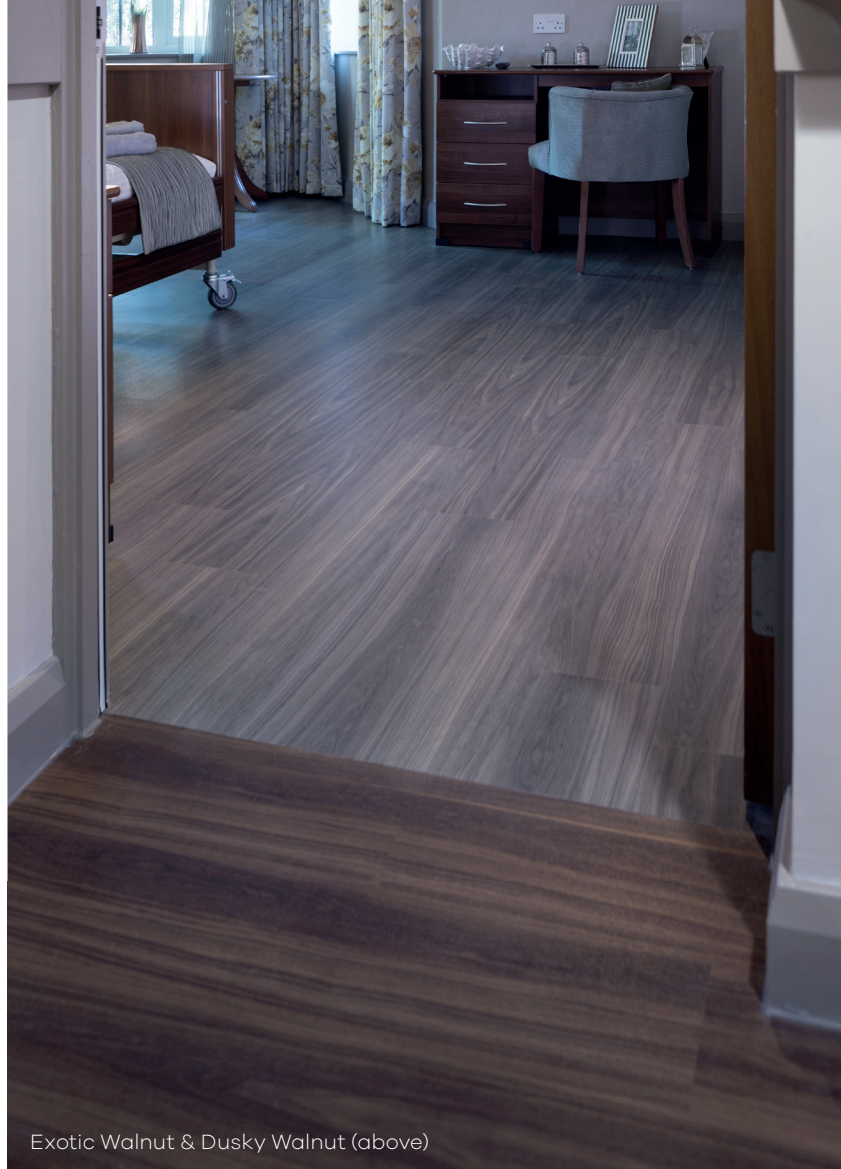
Exotic Walnut & Dusky Walnut (above)