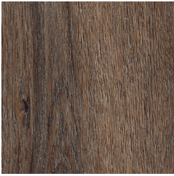
Fumed Oak AROW7900