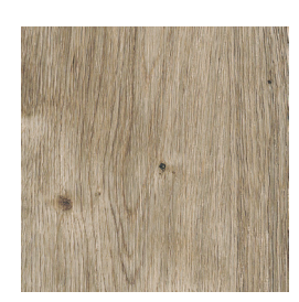
Sun Bleached Oak SS5W2531