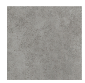
Gallery Concrete SS5S3071