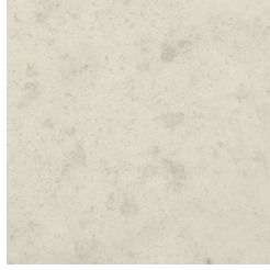
Shottery Limestone AROSLK15