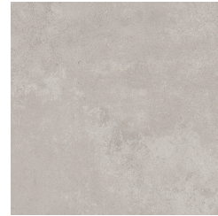
Villa Concrete SS5S2612