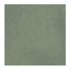
Encaustic Okra AROAEN18