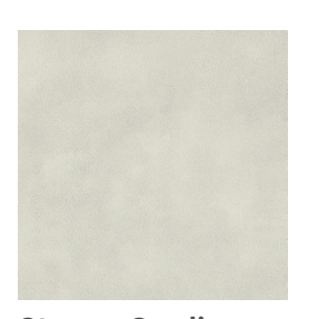
Stucco Opaline AROAUC88