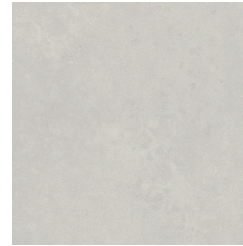
Rialto Concrete SS5S2611